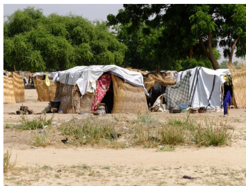
Temporary shelters set up by the displaced community in Monguno.

The DTM Round XII increased its number of assessments to 161 camps across four states; Adamawa, Borno, Taraba and Yobe compared to 155 camps assessed in Round