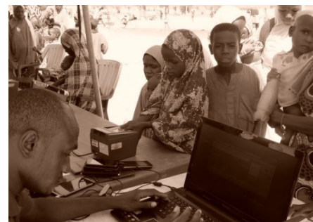
Biometric registration enables the humanitarian community to provide adequate humanitarian assistance for those in need.

UNHCR reported that a system for the registration of returning Nigerians from neighbouring countries continues to be implemented by the Nigerian Immigration Services in partnership with UNHCR. A total of 136,175 returnees were registered in several locations. This includes the Sahuda border entry point in Adamawa where 22,098 people registered; Geidam and Gashua in Yobe saw 24,045 returnees; and Ngala in Borno state 90,572 were registered.