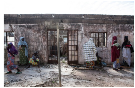
Many people returning to their places of origin choose not to locate in camps but sleep in the ruins of burnt out houses.

There was general endorsement at the HNO workshop that the overall figure of people in need is 13.4 million in the six states covered by the HNO (Borno, Adamawa, Yobe, Gombe, Bauchi, Taraba). A common understanding was reached across all sectors of the methodologies used throughout the HNO process, which sets the benchmark for the HRP.